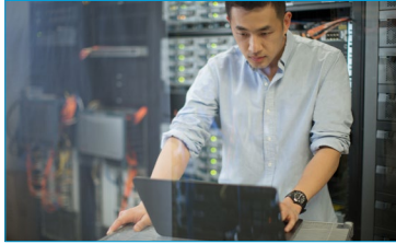
Reduces management requirements by three full-time employees

With Cisco solutions, BluePearl Veterinary Partners: